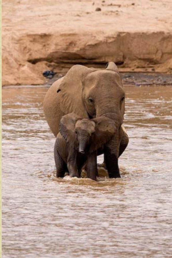
Elephants Crossing Uaso Nyiro River

Canon EOS 1D Mark III, Lens: EF 300 mm, f/2.8L IS USM + 1.4x