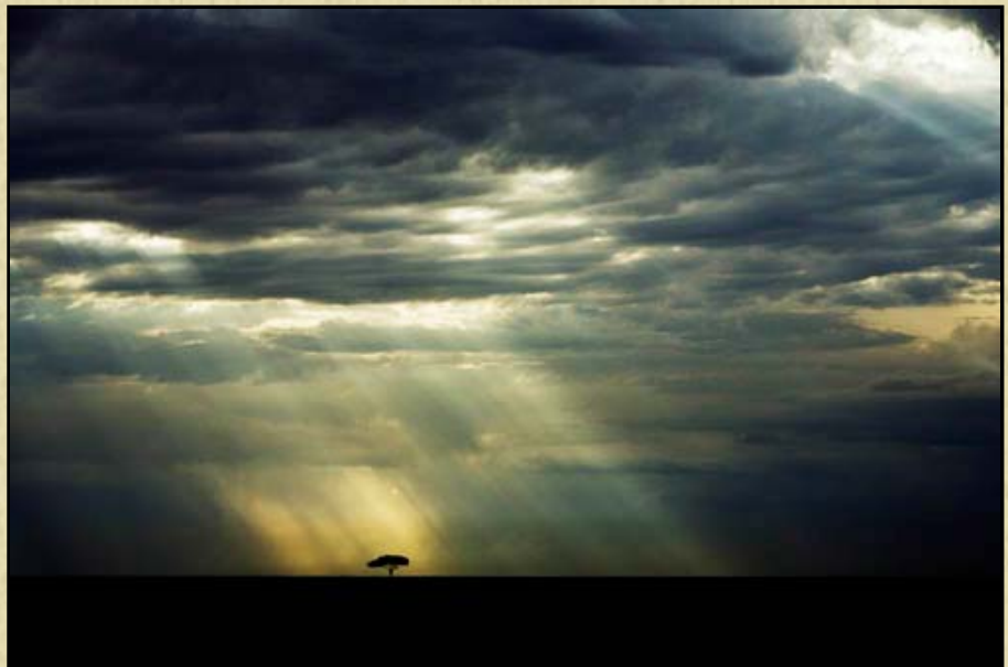
Brewing Storm in the Mara Canon 5D: Canon 70-200

Africa is famous for spectacular sunrises and sunsets. Each day our morning game drive begins before sunrise. On our afternoon game drives, we return to the lodge just after sunset. This gives us the best opportunities to photograph this incredible beauty.