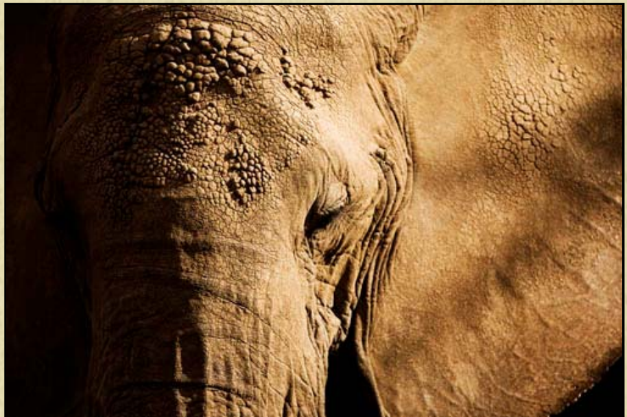
Elephant Texture Canon 5D: Canon 17-40mm

Elephants enjoy rolling in the mud. Not only is it fun, but it also cakes on their hide and protects them from the sun, insects and parasites. The evening sun illuminating a portion of the elephant's head gives a warm, moody feeling to the photo. As photographers, this is the type of light we often hope for.