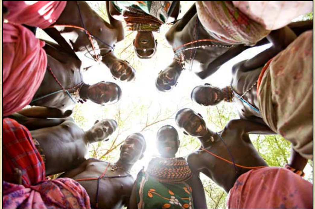
Samburu People Canon 5D: Canon 16-35