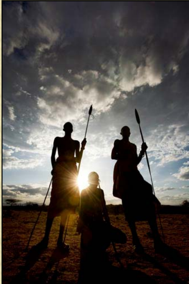
Samburu Warrior Silhouettes Canon 5D: Canon 16-35

Scott also suggested asking people to step out of the group and pose in a different location and don't be afraid to use props such as spears, bow and arrows or what ever is available that will make for a more interesting photo. Scott says the most important thing to consider when photographing people and wildlife is the light source. Time of day, angle of the light, contrast, shadows and much more are need to be considered when trying to capture the best photos that you can. Scott's favorite motto is "THINK DIFFERENT". He says if you think differently....you will see differently. To see more of Scott's work and many more photos from our trip, visit his web site at www.asa100.com .