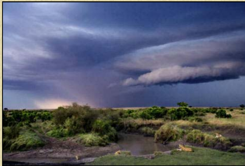
Resting lions in the foreground added interest to this scene. Lions at the River Canon 5D: Canon 16-35

On several evenings spectacular storm clouds blew in over the Masai Mara from Lake Victoria .