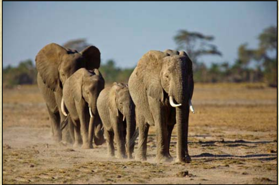
Follow The Leader Canon 5D: Canon 500 and 1.4 Reconverted

Elephants crossing the sun baked, dry lake pan in Amboseli.