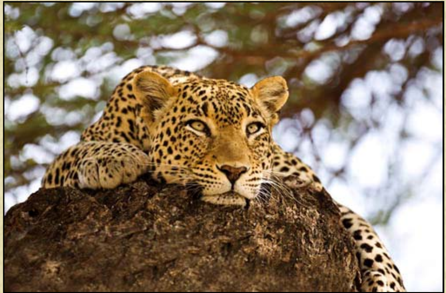
Leopard Canon 5D: Canon 500

In Samburu we saw five leopards. This female seemed to enjoy posing for us. We have been very fortunate in finding her on most of our trips to Samburu. This time she had a cub. It was so shy that as soon as we spotted them, it ran down the tree and was hid in the grass. Mom, on the other hand, stayed around for quite some time. She was wonderful!