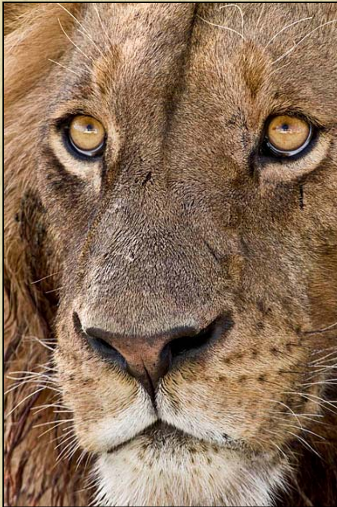
Male African Lion Canon 1D-Mark III: Canon 100-400 IS

The animals have become accustomed to seeing tour vehicles. On our safaris we are often able to get quite close to the wildlife without being in danger or endangering them. Notice our Land Rover reflected in the eyes of the lion. This big male was lying at the edge of the road about 5 or 6 feet from the vehicle. He seemed not to mind us at all!