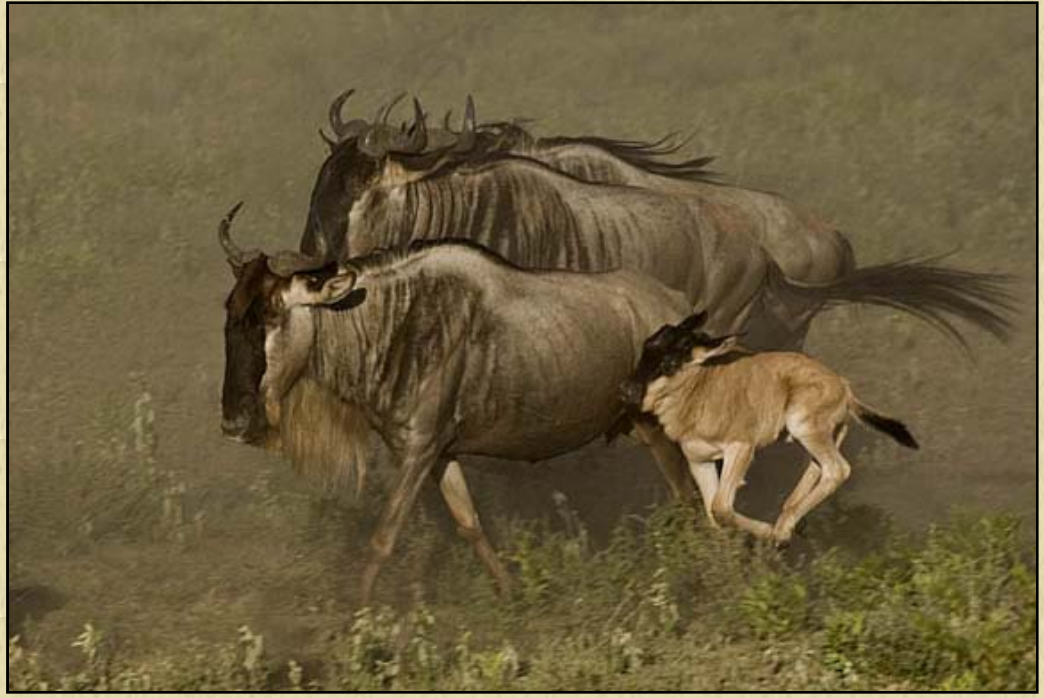
Mother and Baby Wildebeest Canon 1D-Mark III: Canon 100-400 IS

minutes they were each running in circles around their mothers. The calves need to be able to run quickly to avoid being caught by predators.