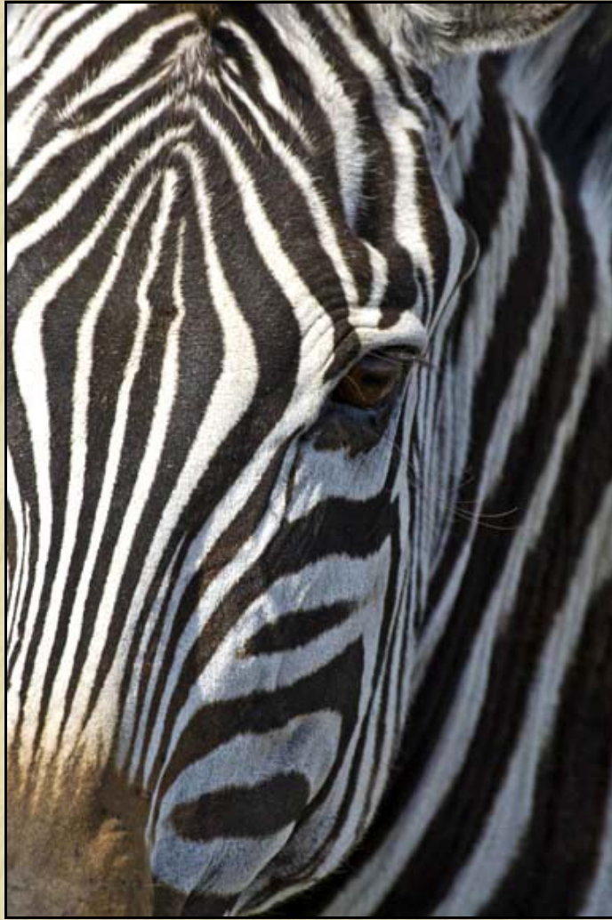
Zebra Canon 1D-Mark III: Canon 100-400 IS

On our way back from a quaint little fishing village on the shores of Lake Victoria, we spotted this leopard eating a warthog. He had carried the carcass up into a tree next to the road. It was thrilling to experience a leopard at such close range. He was a large, old male and looked as though he had survived some fierce battles.