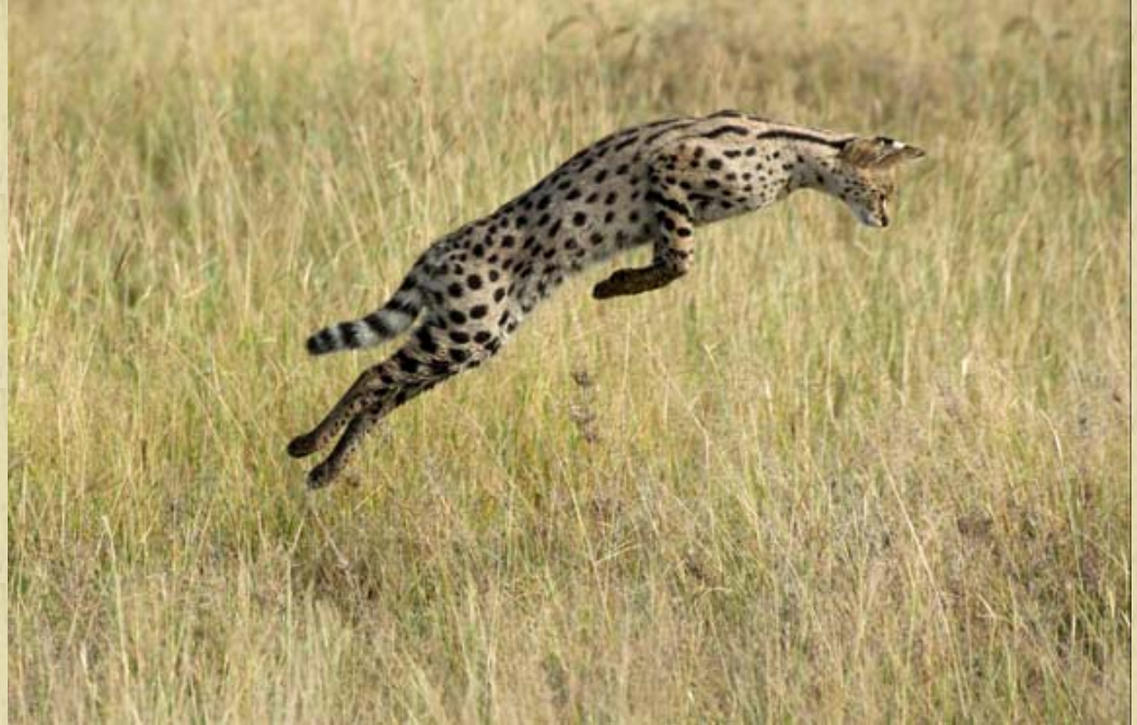
The Attack Canon 1D-Mark III: Canon 100-400 IS