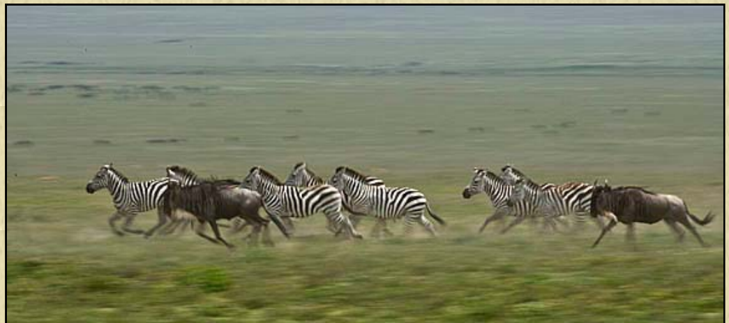
Zebra and Wildebeest Canon 1D-Mark III: Canon 100-400 IS

February and March are great months to experience the migration of thousands of wildebeest and zebra in the southern end of the Serengeti. As we drove through the huge herds of animals we were in awe of their sheer numbers and size of the herds. It is an exciting time of year because tens of thousands of baby wildebeest are born during a three to four week period. So many are born during this time, that even though the predators eat quite a few, most of the babies survive.