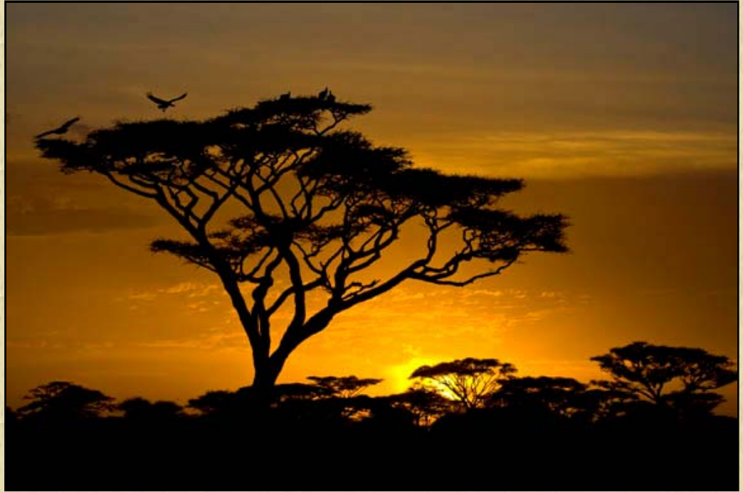
Acacia Tree and Vultures Canon 1D-Mark III: Canon 100-400 IS

Africa is famous for spectacular sunrises and sunsets. Each day our morning game drive begins before sunrise. On our afternoon game drives, we return to the lodge just after sunset. This gives us the best opportunities to photograph this incredible beauty.