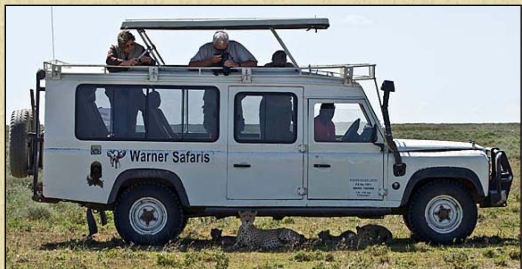
Cheetah family resting under one of our vehicles. Canon 1D-Mark III: Canon 100-400 IS

One morning, during our game drive, a mother cheetah and her six cubs found the shade created by one of our vehicles to be quite comfortable. It was a nice break for them from the warm sun on the Serengeti Plains.