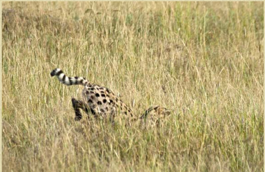
The Catch Canon 1D-Mark III: Canon 100-400 IS

The serval cat caught what it was after, but kept it hidden in the grass while it ate, so we were unable to see what had been caught. Regardless, we were all thrilled to see the hunt! It is quite rare to see serval cats so we considered ourselves extremely lucky.