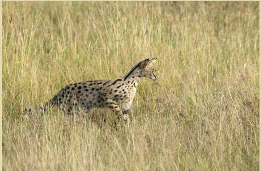
Serval Cat Spots It's Prey

As we were returning to the lodge for a late breakfast we happened upon this serval cat out for a morning hunt. Suddenly it spotted it's prey, stopped in it's tracks and focused on something in the grass.