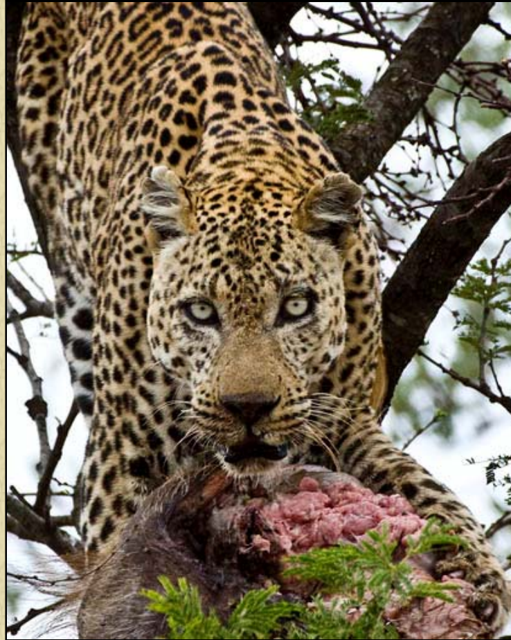
Leopard and Kill Canon 1D-Mark III: Canon 100-400 IS