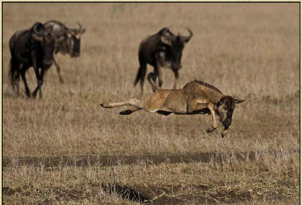
Look Mom! No Feet !!! Canon 1D-Mark III: Canon 100-400 IS

One week old wildebeest calf leaping over a ditch