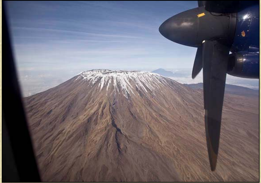
Mount Kilimanjaro Canon 1D-Mark III: Canon 17-40mm

February and March are great months to experience the migration of thousands of wildebeest and zebra in the southern end of the Serengeti. As we drove through the huge herds of animals we were in awe of their sheer numbers and size of the herds. It is an exciting time of year because tens of thousands of baby wildebeest are born during a three to four week period. So many are born during this time, that even though the predators eat quite a few, most of the babies survive.