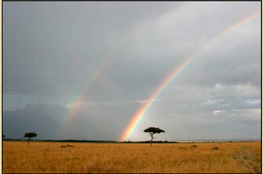
Double Rainbow in the Mara

We had been on the plains in the Mara watching two cheetahs. As we headed for the lodge we were fortunate to see a double rainbow. A beautiful ending to an amazing day!