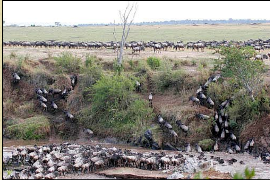
Wildebeest Crossing the Mara River

It was treacherous going as they scrambled up the steep, wet, muddy cliffs on the far side of the river. We were fortunate to witness two crossings on this safari. I felt as though we had been given an extra special gift.