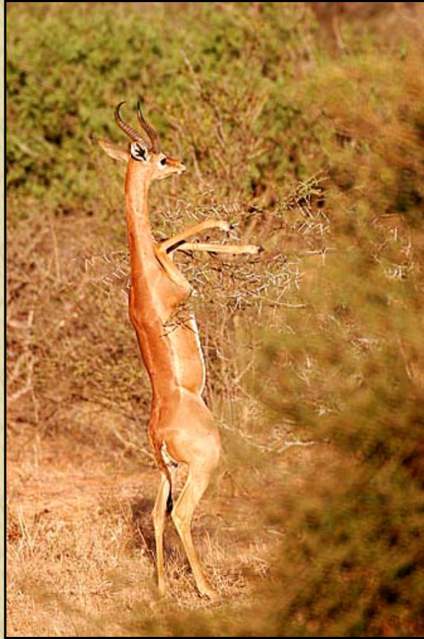
Gerenuk Eating Acacia Leaves