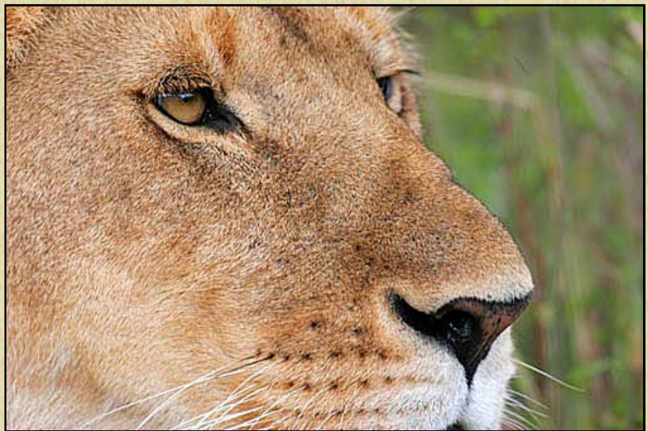
Contemplating African Lion

Our Somak Safari guides were awesome! They found everything we wanted to see and so much more. They were always helpful and ready to work any hours we needed and with a smile. They would always do their best to get us in location to get our best photographs in the right light. I have really enjoyed working with the staff at Somak Safaris as they have been exceptional to work with!