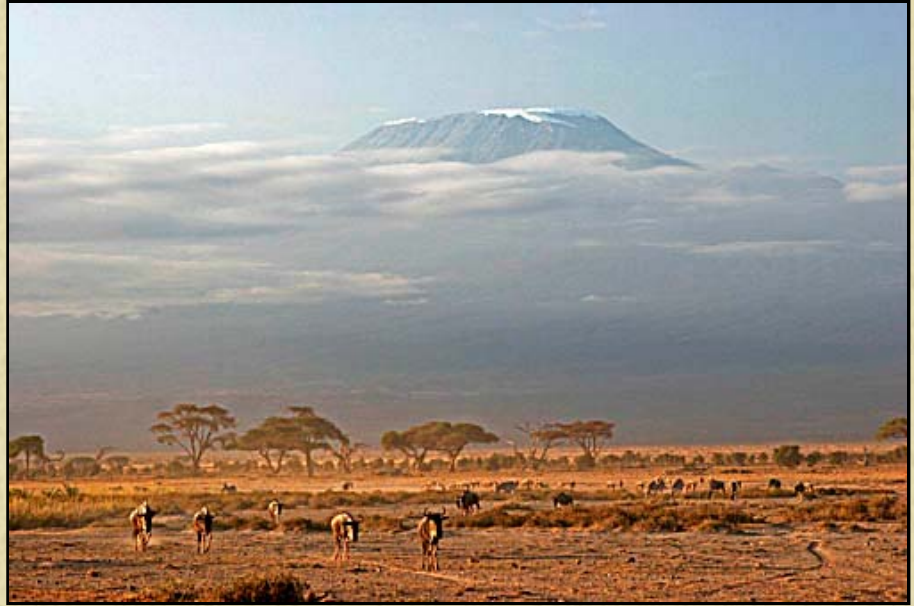
Mt. Kilimanjaro, Wildebeest and acacia trees in early morning light

Canon 20D, Lens- 28 - 105