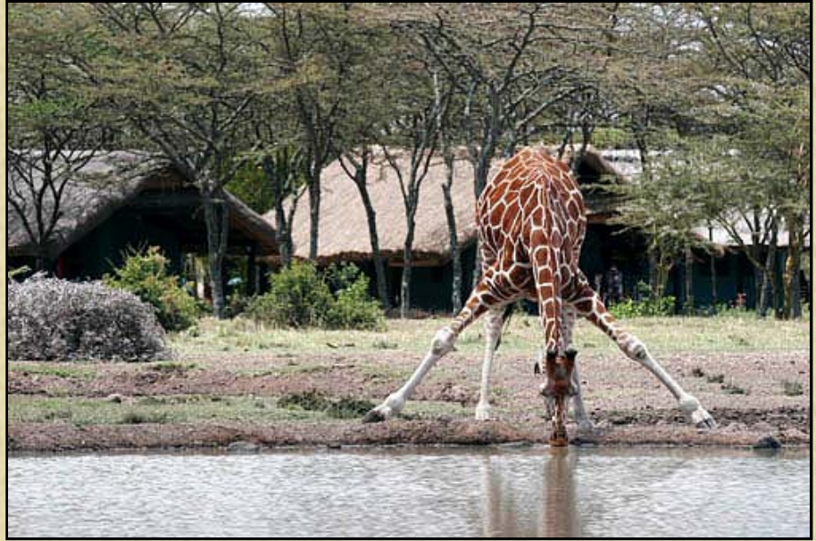
Giraffe and Sweetwaters Permanent Tented Camp