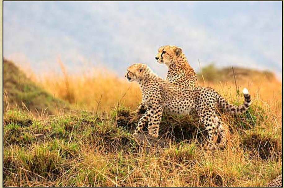
Cheetah and Cub

For photographers and those who just love to watch the animals, one can't say enough good things about Kenya's Masai Mara! It is a magical place! We saw and experienced one great scene after another! We watched a mother cheetah catch and feed her three cubs a Thomson's Gazelle, We saw a pride of lions and their cubs feeding on two wildebeest they had just killed. Not one but two wildebeest! We witnessed the migration of thousands of wildebeest and zebra as they headed toward the Mara River and were lucky enough to see crossings on two different days.