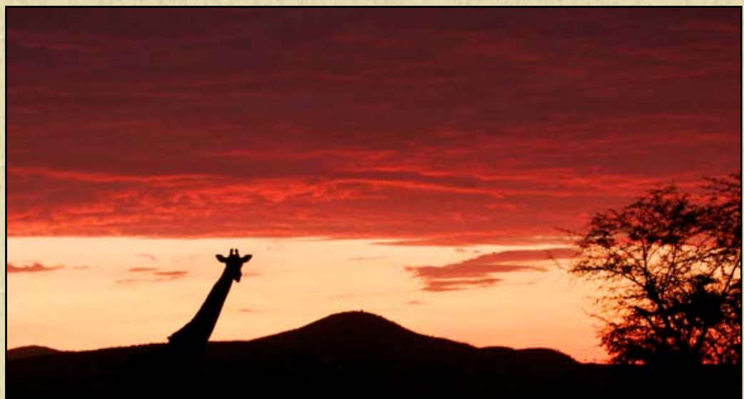
Giraffe at Sunrise in the Masai Mara

Consider giving an African Safari for the Holidays or graduation. It will be remembered for a lifetime as one of their life's greatest experiences. What a gift! For dates and information regarding my upcoming safaris click here .