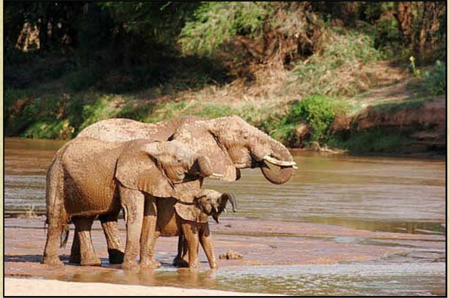
Elephants in the Uaso Nyiro River, Samburu

species of wildlife. It is a fabulous park where we enjoyed great photo opportunities with lions, leopards, cheetahs, elephants, oryx, gerenuk, grevey's zebra, lesser kudu, somali ostrich, reticulated giraffe and so much more! WOW!!! It is truly an incredible place!