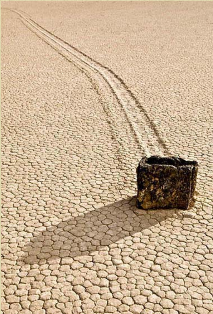
Rock And Trail At The Race Track Canon 7D, Lens: Copyright: Paul Renner, 20100

be rough, to save wear and tear to your vehicle, I will be renting a van for transporting us during the workshop and even to take us to the Racetrack (weather and road permitting). You are also welcome to drive your own car, should you prefer. We have a group of wonderful people signed up and only have a few more spaces available so contact me immediately to reserve your space and to receive a discounted hotel room rate (only available through Dec. 7th). For information on the Death Valley photography workshop Click here .