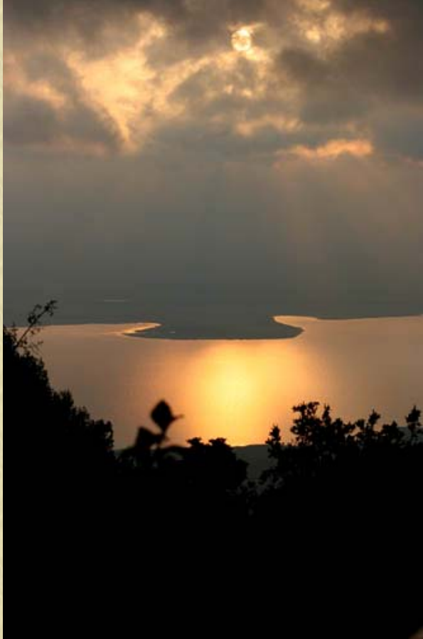
Another Morning In Africa Canon

Our African photo safaris are the trip of a lifetime! I am so thankful to have been born and grown up in East Africa. Now that I am able to take people with me and share what I know about photography along with my personal experiences of Africa, I am thrilled so many clients return and say to me "that was the best trip I have ever been on" or "thank you for the vacation of a lifetime! I want to go again soon!"