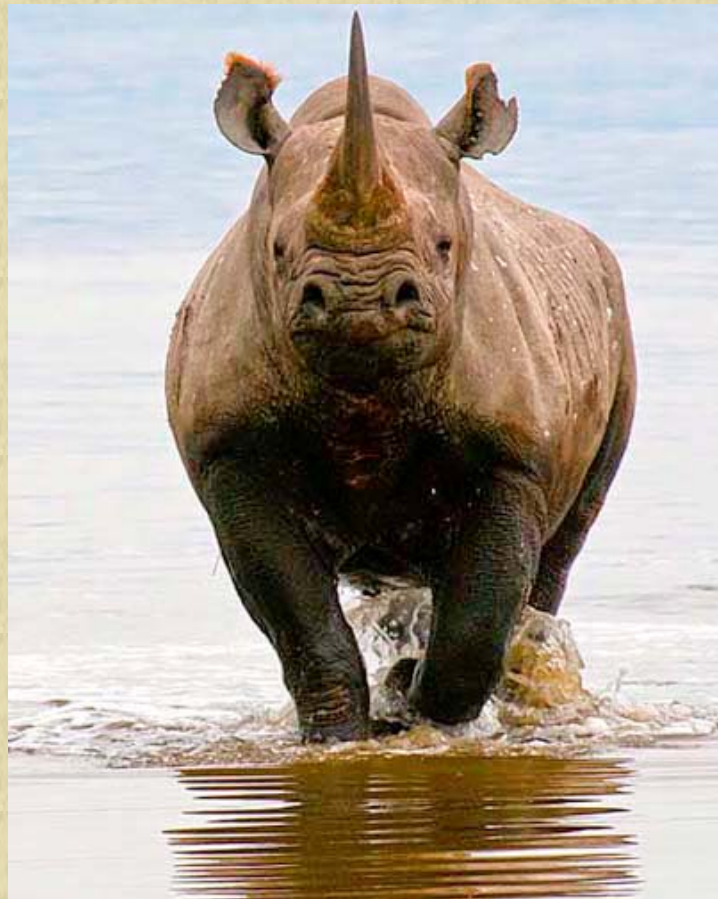
Black Rhino in Lake Nakuru Nikon D300, Lens: 200.0-400.0 mm f/4.0

This month I am honored to be sharing photos that were taken by clients who went on our July photo safari to Tanzania and Kenya. It was another spectacular trip with countless photo opportunities and excitement too!