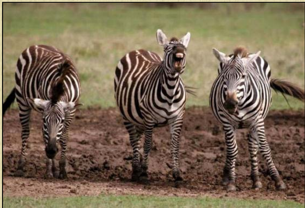
Canon30D, Lens- 100 - 400IS

This month I am showing photos taken by tour participants that went on the February 2007 safari to Tanzania. You don't have to be a professional photographer to get great pictures on our safaris!