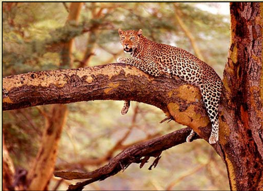
Leopard at Lake Nakuru Canon 20D Lens: Canon 100-400IS

I am excited because we leave on our safari to Kenya and Tanzania on July 12th. I can hardly wait to be out there again!!!