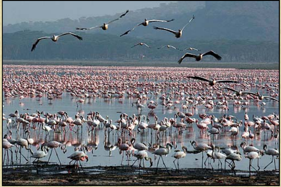
White Pelicans and Flamingoes Canon 20D Lens: Canon 100-400IS

Art Show season is in full swing! I am currently selling my photography at the Sawdust Festival (Booth 209) and at the Art A Fair (Booth B22) in Laguna Beach, California thru September 2, 2007. I would love too have you stop by for a visit and to see my latest photography.