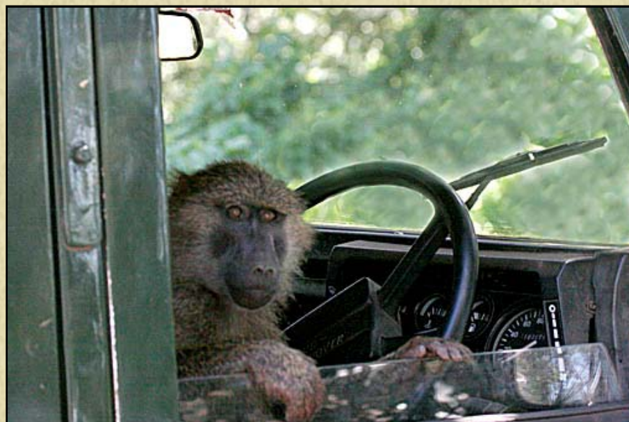
Baboon in Land Rover Canon 20D Lens: Canon 100-400IS

I am sure that after paying all that money and enduring the long flight you would be more than a little disappointed to discover your guide doesn't even speak english!!! Choose your safari company wisely!