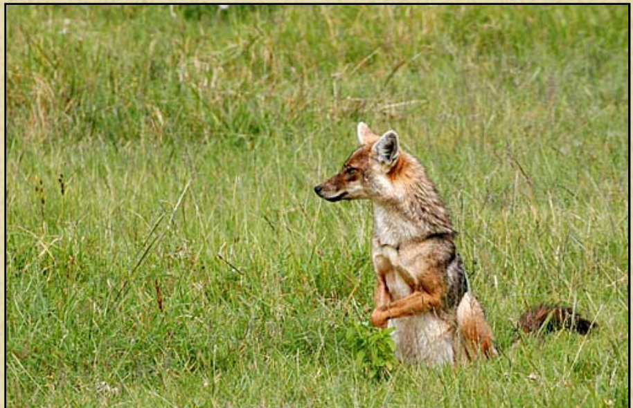
Black Backed Jackel Hunting Canon 20D Lens: Canon 100-400IS

Smaller predators such as Jackels, are fascinating to watch as they skillfully move through the tall grass looking to pounce on rodents and other small game. They are also able scavengers and always on the lookout to steal a free meal or scraps left by larger predators.