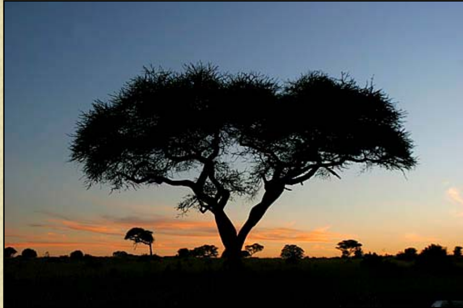
Acacia Tree At Sunrise Canon 20D Lens: Canon 28-105mm

Africa is famous for its spectacular sunrises and sunsets. Each day our morning game drive begins before sunrise and on our afternoon game drives we return to the lodge just after sunset. This gives us the best opportunities to photograph this incredible beauty.