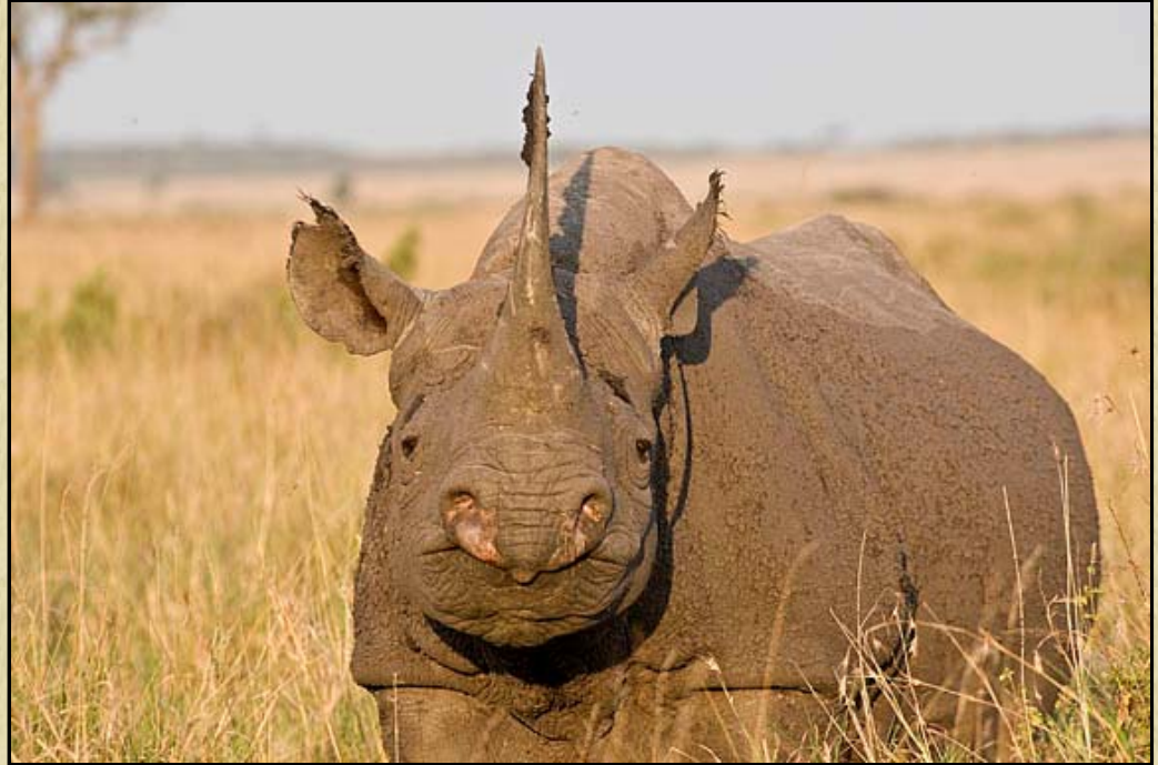
Black Rhino Canon 1D-Mark III: Canon 100-400 IS

Black Rhino are beginning to make a comeback from the edge of extinction. In all of Tanzania, there are only about thirty of them, all in Ngorongoro Crater. They are most often seen at a distance. While in the Masai Mara in Kenya, we were fortunate to get up close and personal with this female.