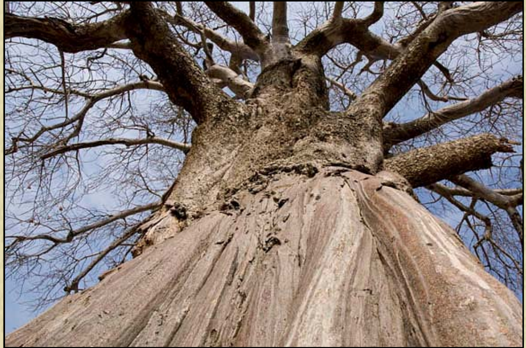
From Under the Baobab Tree Canon 20D: Canon 17 - 40

Baobab trees are also useful as rest stops and scratching post.