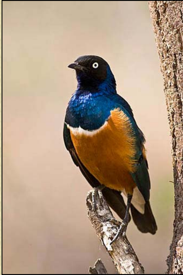
Superb Starling Canon 1D-Mark III: Canon 100-400 IS

Lilac Breasted Rollers are often seen sitting on branches along the outer edges of trees vigilantly watching for their chance to swoop down on an unsuspecting grasshopper for a hearty meal.