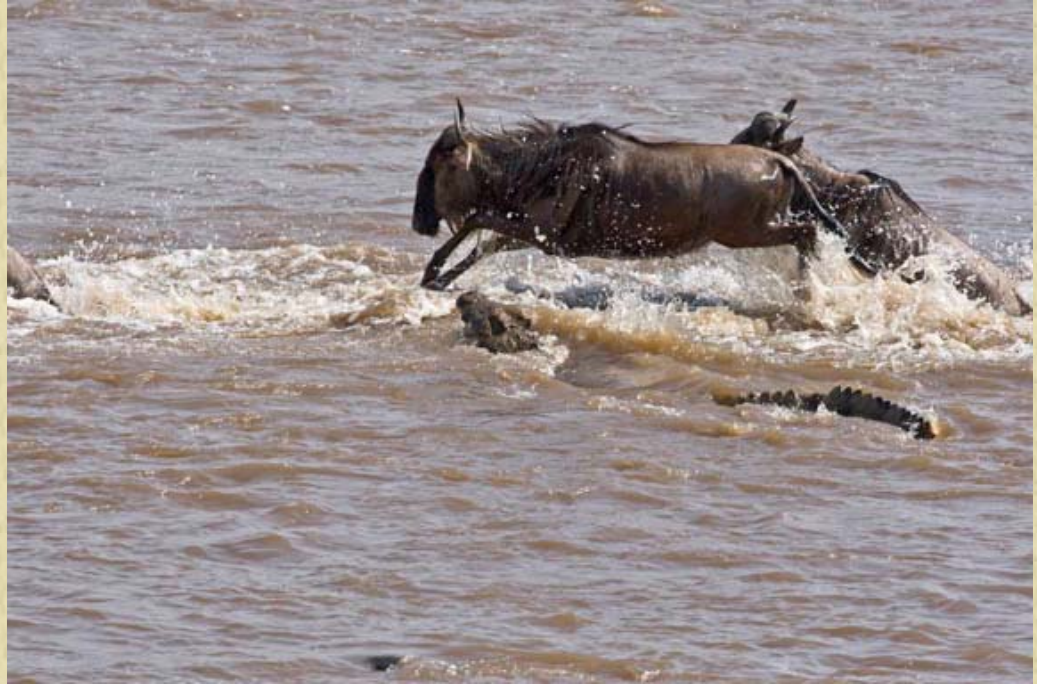
Wildebeest and Crocodile Canon 1D-Mark III: Canon 400mm 5.6

Africa is famous for spectacular sunrises and sunsets. Each day our morning game drive begins before sunrise. On our afternoon game drives, we return to the lodge just after sunset. This gives us the best opportunities to photograph this incredible beauty.