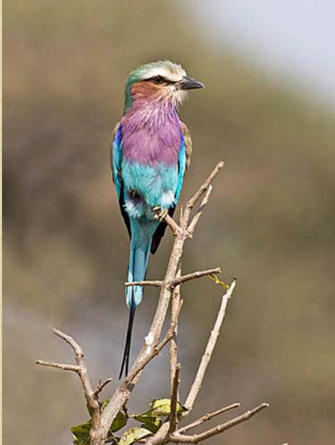
Lilac Breasted Roller Canon 1D-Mark III: Canon 400mm 5.6