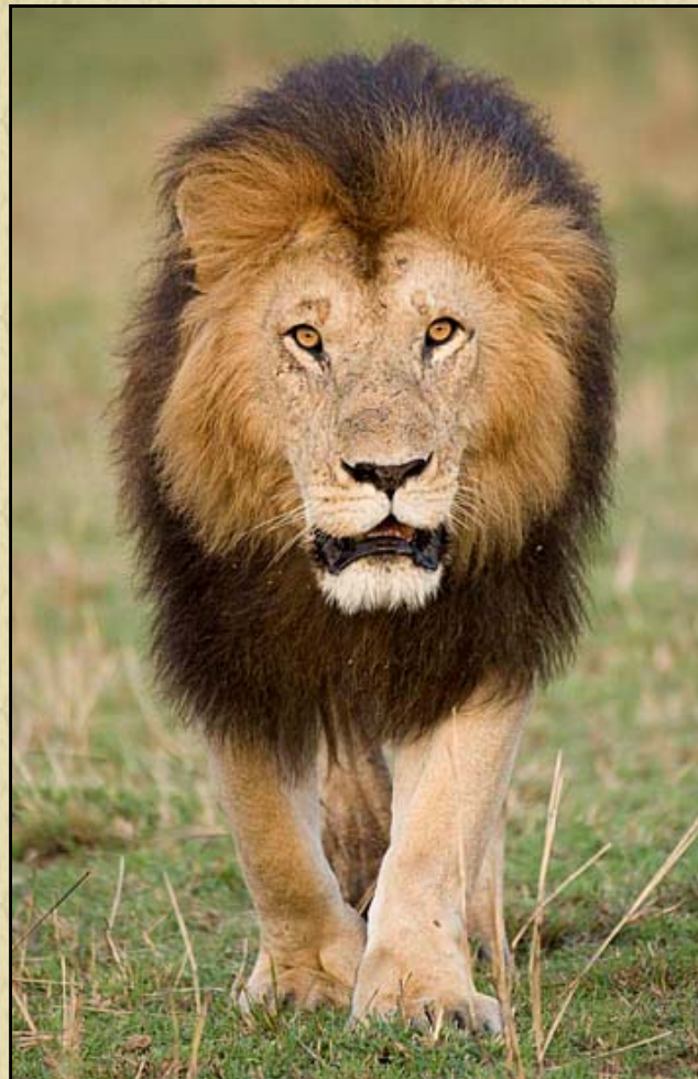
Black Maned Lion

We were on a private photo safari in Kenya's Masai Mara. It was early, before sunrise, when Wakalele, our African safari guide, calmly stated "There is a lion walking there". It was a male. Suddenly we saw two more lions. One was a female, and the other had to be one of the most magnificent male lions I had ever laid eyes on! What a way to begin our morning game drive. It was wonderful to be on safari in Kenya again!