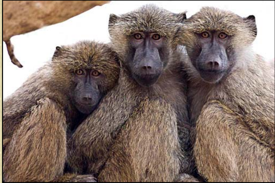
Baboons snuggled together on a branch after a good nights rest up in a large tree. Canon 1D Mark III: Canon 100-400 IS

Our July trip was a a private safari for our family and friends. There was a total 18 of us. I was feeling a certain amount of pressure to ensure we had a great safari because they are family and friends and I hope to spend considerable time with them in the future. I am happy to say that both Kenya and Tanzania delivered! Everyone was thrilled and even better, they are all still talking to each other and have become better friends too! We can hardly wait to get together at our upcoming trip reunion to share our favorite memories and photos from the trip.