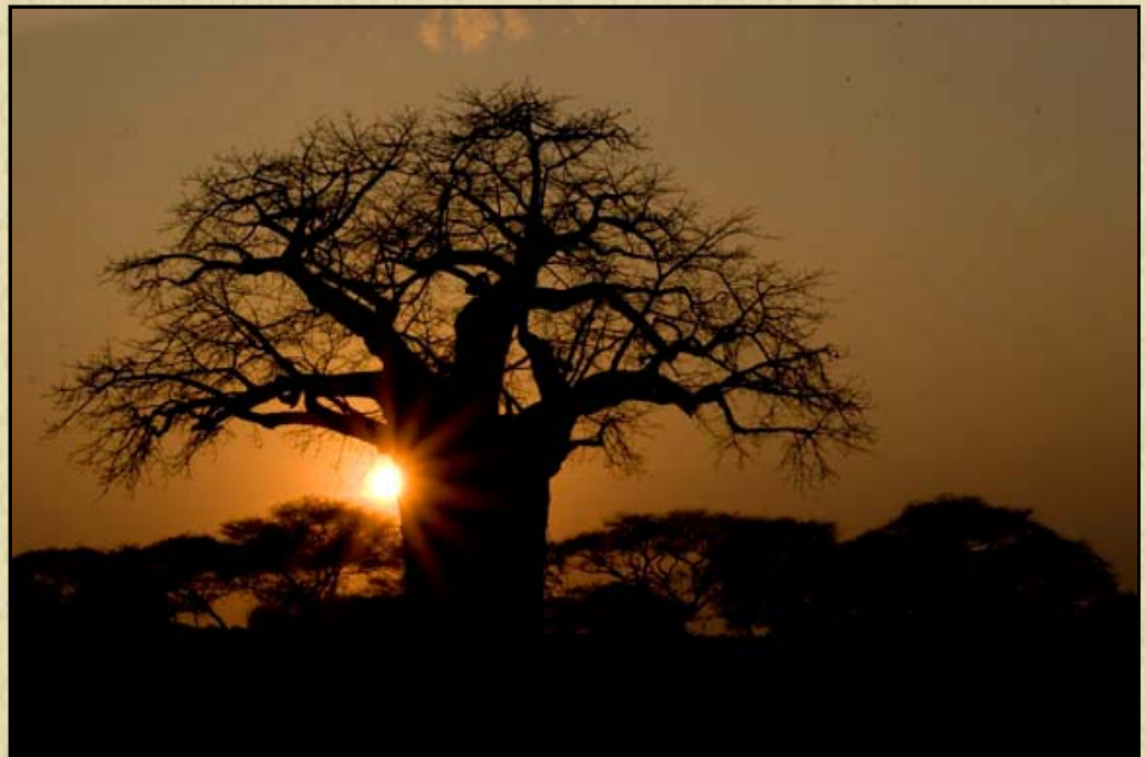
Baobab Tree at Sunset Canon 1D Mark III: Canon 17 - 40

Africa is famous for spectacular sunrises and sunsets. Each day our morning game drive begins before sunrise. On our afternoon game drives, we return to the lodge just after sunset. This gives us the best opportunities to photograph this incredible beauty.