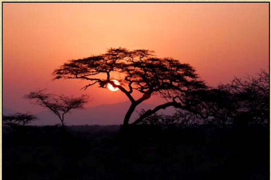
Sunrise in the Masai Mara

Consider giving your son or daughter an African Safari for graduation. It will be remembered for a lifetime as one of their life's greatest experiences. What a gift! For dates and information regarding my upcoming safaris click here .