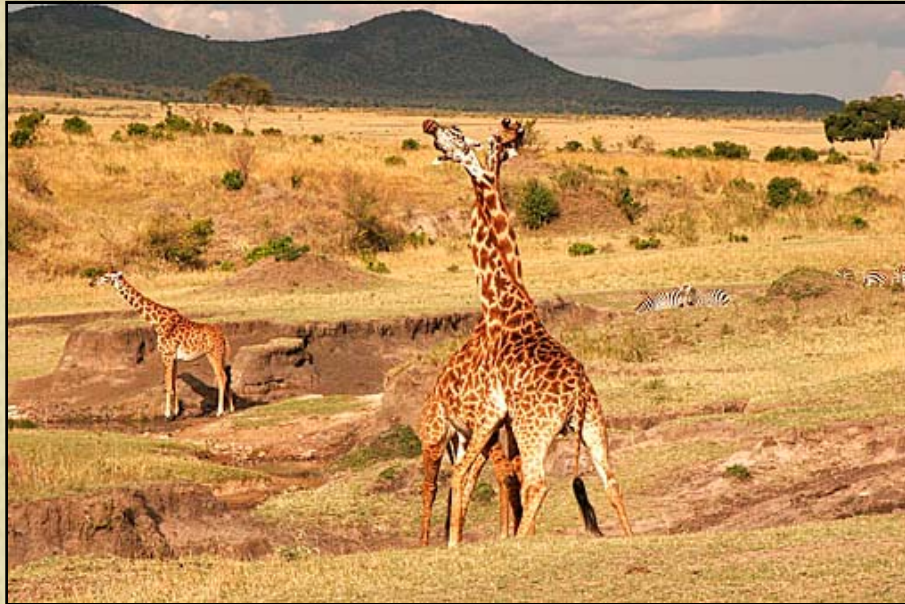
Wrapped Up Giraffes

We watched this battle go on for nearly an hour. Then we got word by radio that a nearby pride of lions was stalking a herd of unsuspecting wildebeest that was moving into their territory. We left the giraffe hoping to witness the lion hunt. Later, with daylight beginning to fade and darkness settling on the land, the lions had not yet made their move so we returned toward the lodge. As we passed by the giraffes we could see them still fighting. True gladiators! Fortunately they rarely do serious injury to each other.