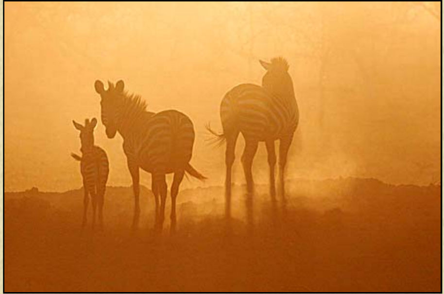
Zebras and Dust

Tarangeri National Park, Tanzania Canon 20D, Lens- 100 - 400IS