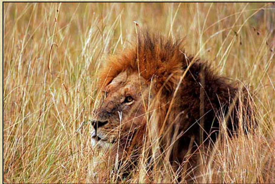
Male Lion Masai Mara, Kenya Canon 20D, Lens- 100 - 400IS

Wishing you a happy and prosperous New Year!!!