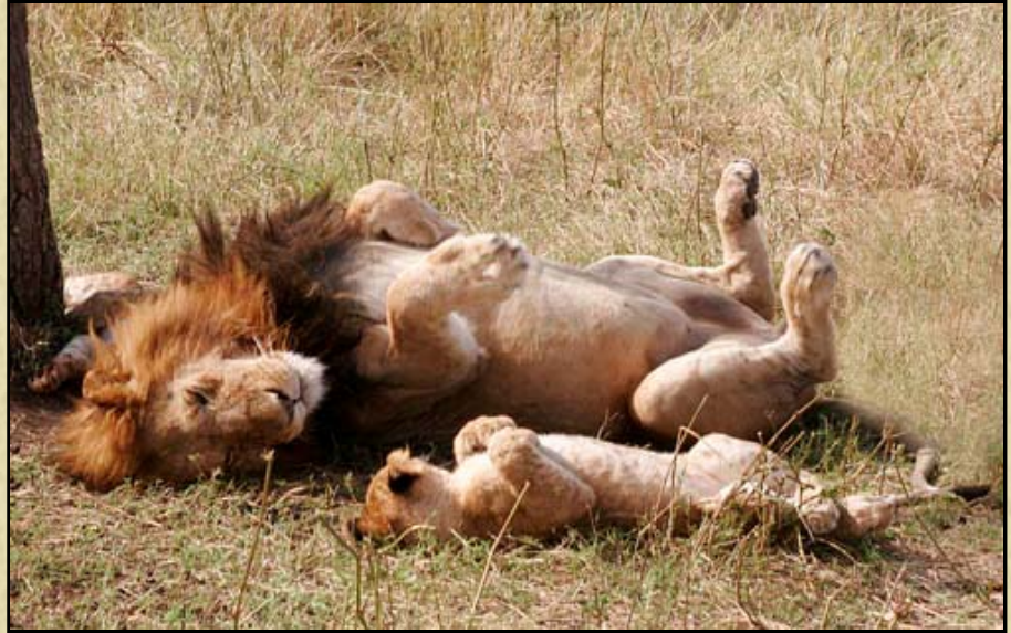
King In Training

Masai Mara, Kenya Canon 20D, Lens- 100 - 400IS