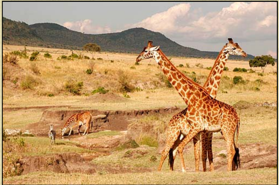
Giraffe and Zebra Masai Mara, Kenya

I was excited as this scene unfolded in front of us. Two giraffes stood with their necks crossed with a third giraffe drinking and a herd of zebra in the background. I had waited a long time for this.