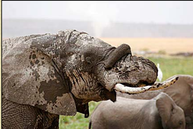
Elephant in Musth

Amboseli National Reserve (Formerly Amboseli National Park)